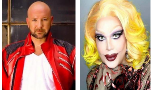
Paisley Parque Hyden Wood