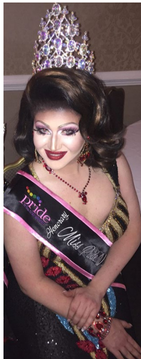
Eden Parque Divine